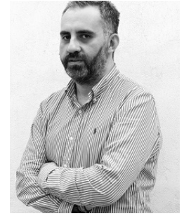
Dimitris Kaltsas @anytime INSURANCE ONLINE BY INTERAMERICAN