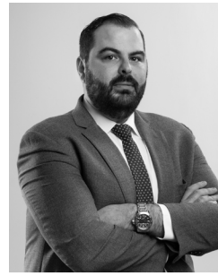
Dimitris Pizanias @anytime INSURANCE ONLINE BY INTERAMERICAN