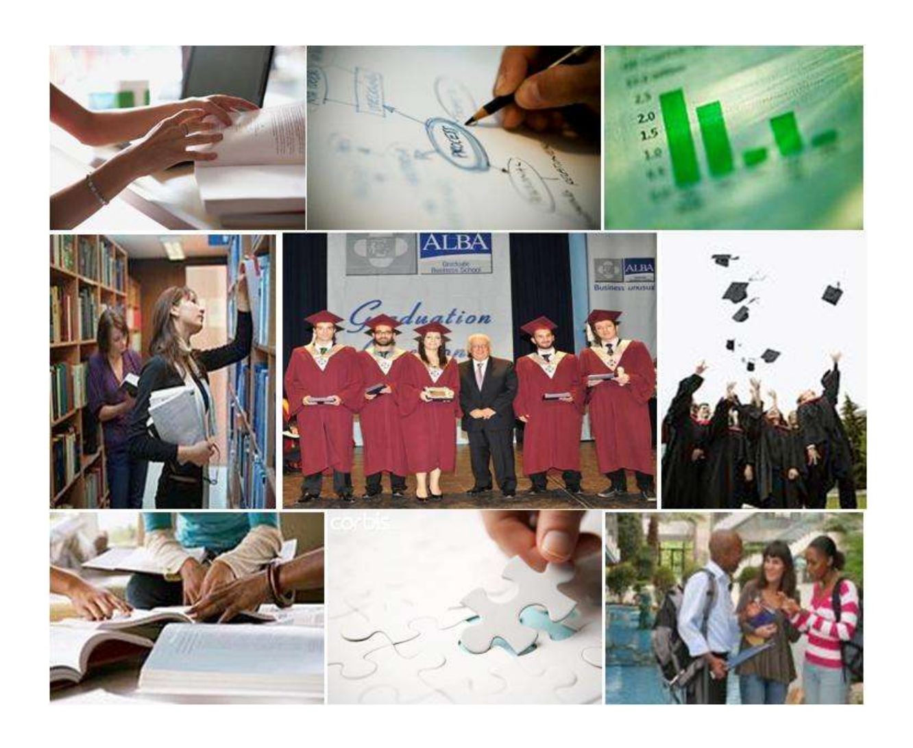
ALBA 2010 Field/Consulting Projects Call for Proposals